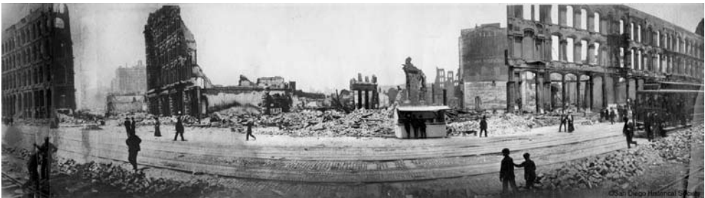
Panoramic photograph showing the aftermath of the 1906 earthquake and fire.