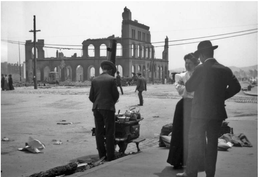
Homeless San Franciscans were asked to do their cooking in the street due to the danger of fire. ©SDHS #1998:40 Anne Bricknell/F. E. Patterson Photograph Collection.

In connection with this tour around the edge, I crossed the burned zone many times and saw the gradual clearing of the wreckage from the streets to permit