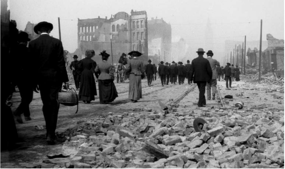
Refugees fled west to the Western Addition and Golden Gate Park, east by ferry to Oakland, or south to San Mateo.

Gate up was crowded with persons and their goods. They were lying around on the sidewalks and in the front gardens of all the Van Ness residences; and it was necessary to walk in the street in order to avoid stepping on Frisco's 400 as it lay asleep on the sidewalk rolled up in furs and opera cloaks. 40