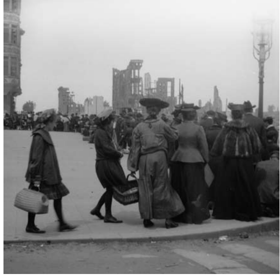
San Franciscans from every social class and neighborhood stood in line for daily rations doled out by the military.