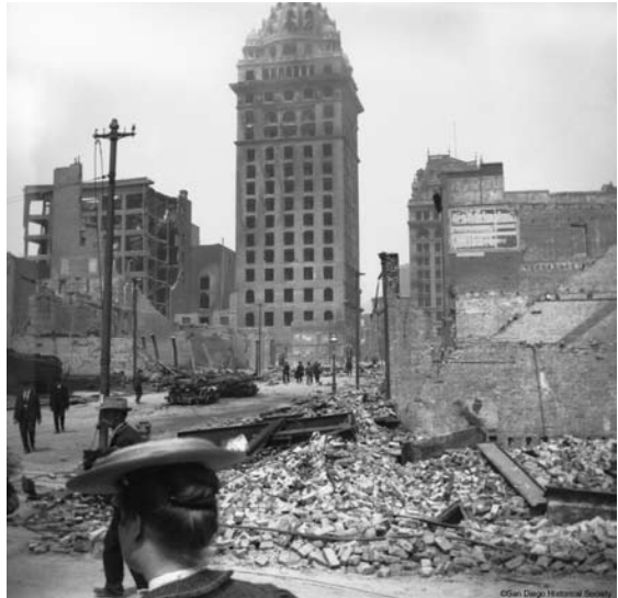
The Call Building at Third and Market Streets. Built in 1898, it was the tallest building in San Francisco with 12 stories. It was gutted by fire on April 18, 1906.

I think it was at the cemeteries that the first automobile passed us. He was going south at a furious rate and we held him up for news. He reported every building of any size in the city down and burning. No water except below