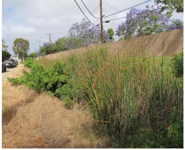
PHOTO NOTES: Looking west at the PBO channel from near the east end of the channel.