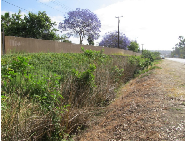
PHOTO NOTES: Looking east at the PBO channel from near the intersection of Pacific Beach Drive and Olney Street.