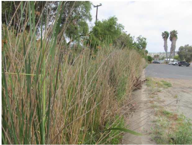
PHOTO NOTES: Looking north at the MBHS channel from its southern end.