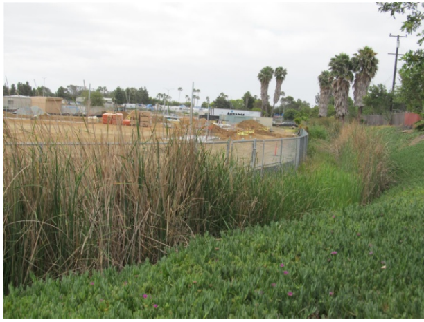
PHOTO NOTES: Looking south at the MBHS channel from the intersection of Thomas Avenue and Quincy Street. Development on one side of the channel and hottentot-fig on the other.