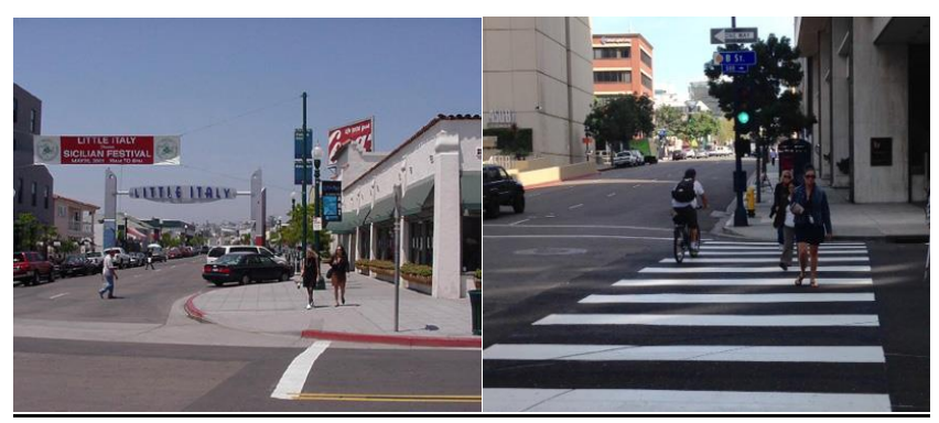
A variety of plans - approved or in progress - outline crosswalks, curb extensions and bike lanes that will make streets safer. These should be implemented as part of repaying, especially where collisions are concentrated.