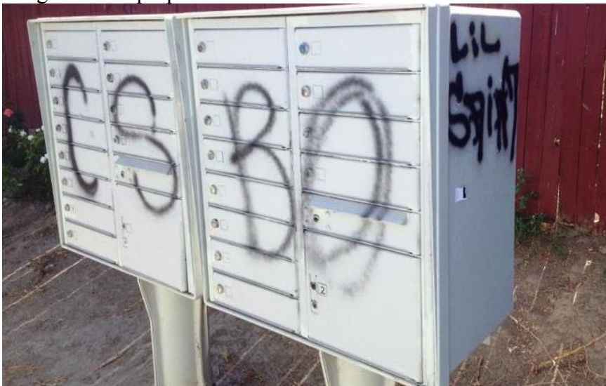
Image of what proposed Cluster boxes would look like

-Proponents think they will save USPS money by shrinking the workforce. A recent GAO (Government Accountability Office) study estimates delivery costs could go down by 55% and 80,000 jobs would be eliminated. However, GAO does not have current delivery cost data or data on how much the post office would lose as use would go down. GAO recommends further study.