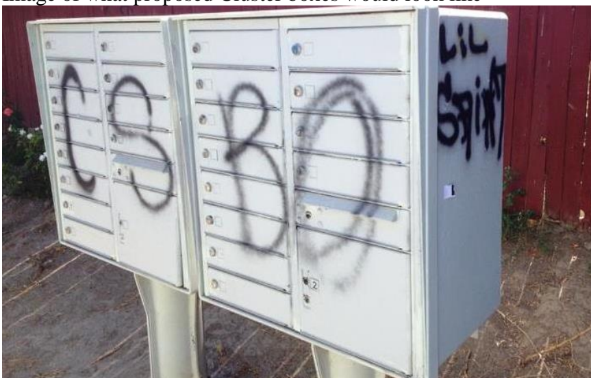
Image of what proposed Cluster boxes would look like

-Proponents think they will save USPS money by shrinking the workforce. A recent GAO (Government Accountability Office) study estimates delivery costs could go down by 55% and 80,000 jobs would be eliminated. However, GAO does not have current delivery cost data or data on how much the post office would lose as use would go down. GAO recommends further study.