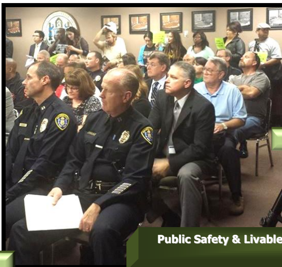
Public Safety & Livable Neighborhoods Committee Meeting