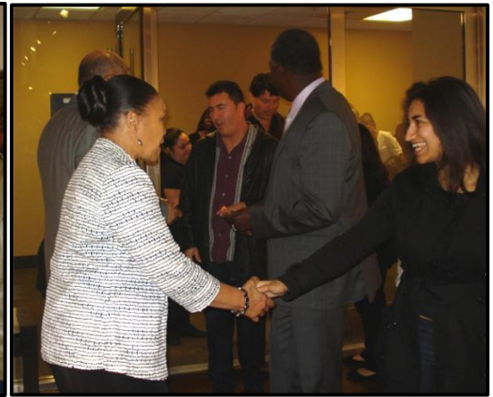
Pictured here greeting concert-goers | Making CD4 a destination place for arts & culture