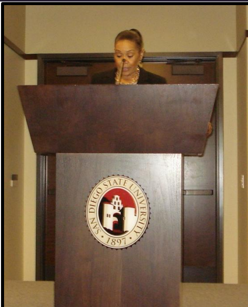
Opening Remarks | San Diego State University's Department of Africana Studies | Rev. Dr. MLK, Jr. Luncheon