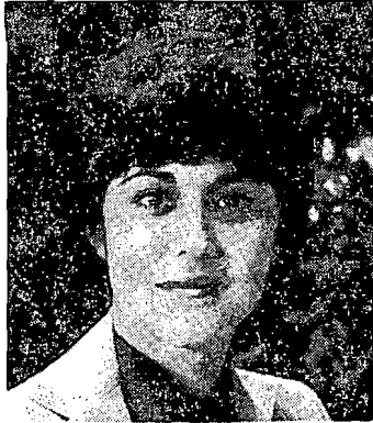
SUSAN GOLDING City Councilmember First Choice of Voters in District Primary