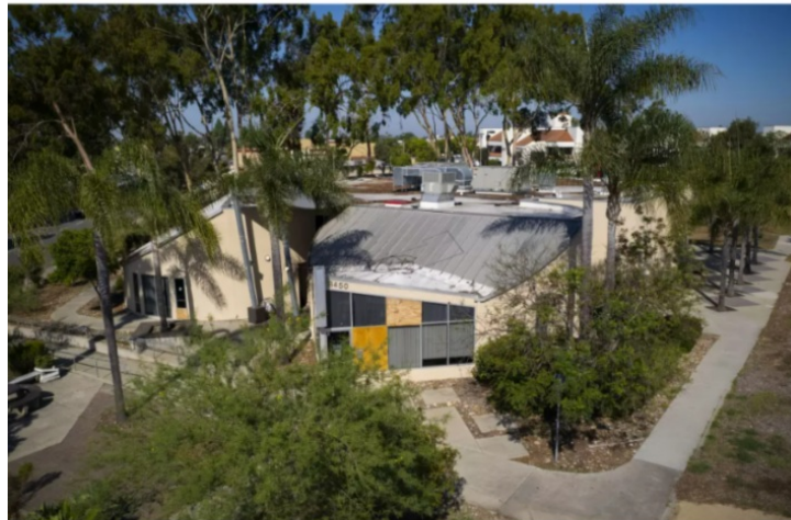
The new plan for the Epicentre could mark a positive turn for a facility with a checkered history

PHOTOS The $8 million plan to revive a once-popular venue and community center, 'boarded up for all these years'