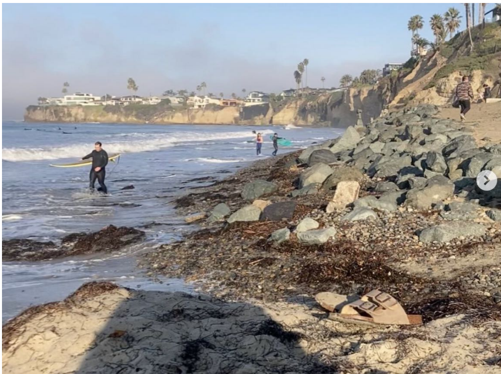
The ocean reaches the toe of the revetment during annual King Tides (2022)