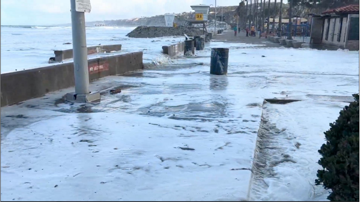
Flooded La Jolla Shores during the November '24 King Tides