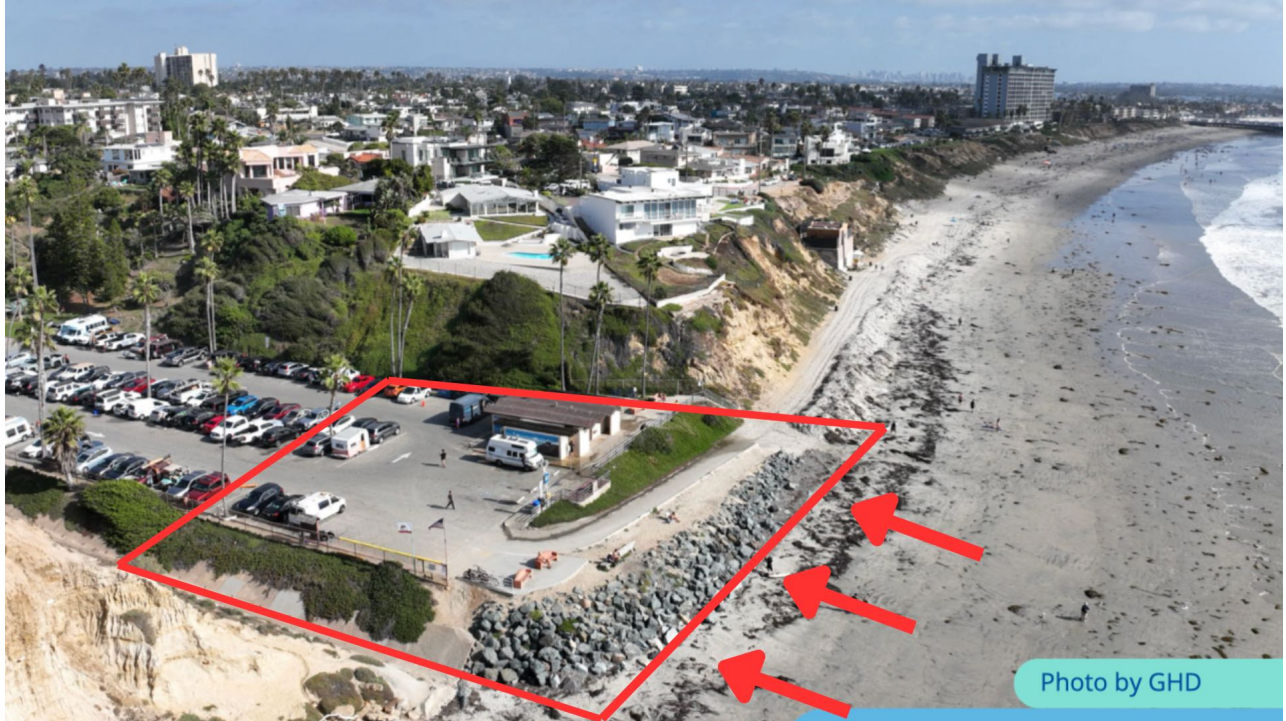
Giving the beach more space is the only way to create a Resilient Surf Park