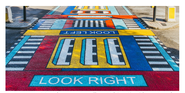
Mural on crosswalk at White City Place, London

Art in the right-of-way integrates artwork, creative elements, and cultural experiences into public spaces such as sidewalks, streets, and plazas. These activations aim to promote a sense of place, foster engagement and connectivity, and promote cultural expression in the public realm. Art can be integrated into right-of-way infrastructure in various of forms, including street furnishings, lighting, performances, temporary installations, wayfinding, and paving materials. The City's Public Art Program enables the design and implementation of public art in eligible active transportation infrastructure, creating visible, community-centered spaces for users. Collaboration across departments, as well as partnerships with SANDAG, MTS and Caltrans, will support the implementation of the City's Public Art Master Plan and a future citywide cultural plan. This will strengthen connections with cultural amenities and promote placemaking within mobility projects.