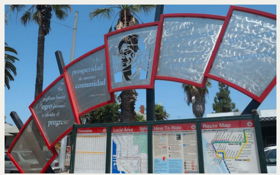
Public art integrated into transit station

The City of San Diego has an established arts and culture program that guides the creation and integration of art in public spaces. The program is rooted in the City's Urban Design Element of the General Plan and is guided by the Public Art Master Plan. Council Policy 900-11 outlines the process for including public art into capital improvement projects, while the Municipal Code requires 2% of the budget of eligible construction projects to fund the Public Art Program. Additionally, Ordinance 19280 stipulates that 1% of the project budget of eligible private development be allocated for art or cultural enhancement. These funds may also be used to enhance Mobility Master Plan projects in the implementation phase.