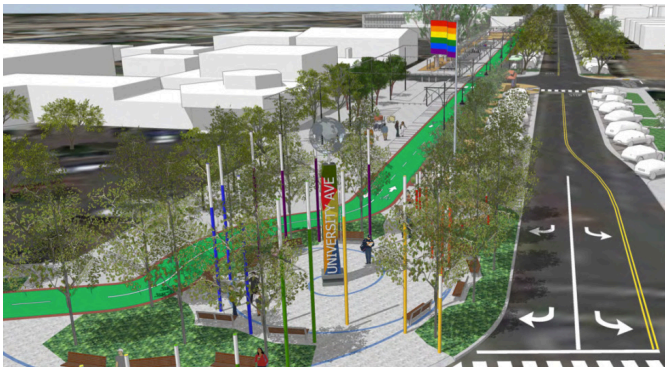
Normal Street promenade funded by Uptown CPD revenue

Community Parking Districts (CPDs) are entities established by the City Council to manage parking within a defined area. These districts provide a mechanism for communities to develop and implement strategies tailored to their specific parking needs and challenges. Parking meter revenue collected within a CPD is reinvested back into the district to fund neighborhood improvements, such as mobility initiatives, curb and parking evaluations, and other parking management projects. Currently, the City has seven CPDs, established in Downtown, Uptown, Mid-City, Pacific Beach, Old Town, Kearny Mesa, and San Ysidro. Initiatives supported by CPDs so far include neighborhood shuttles, wayfinding signage, curb ramps, parking meter installations, pedestrian promenades, and various design and planning studies.