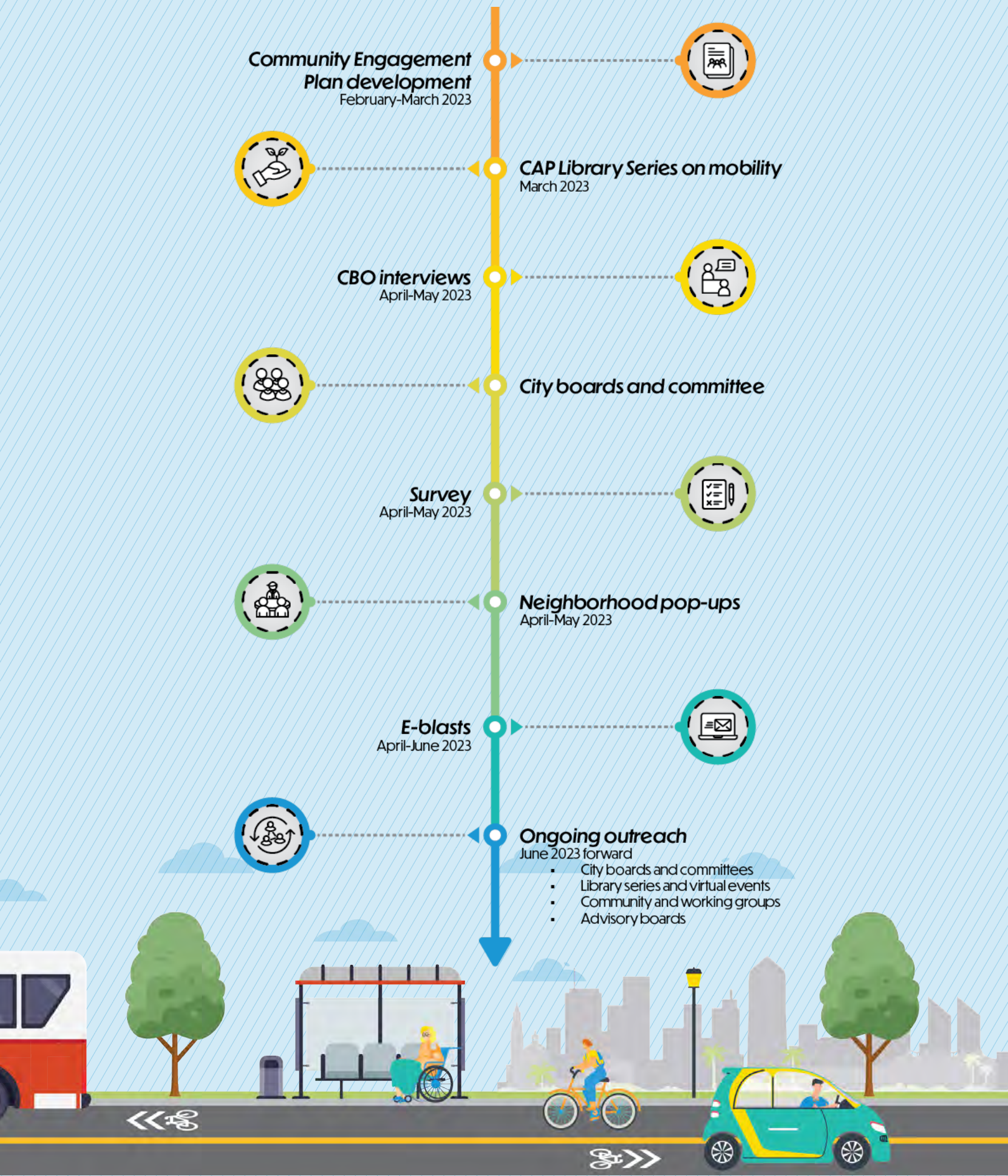
FIGURE 4-1: Community Engagement Timeline for the City's First Mobility Master Plan