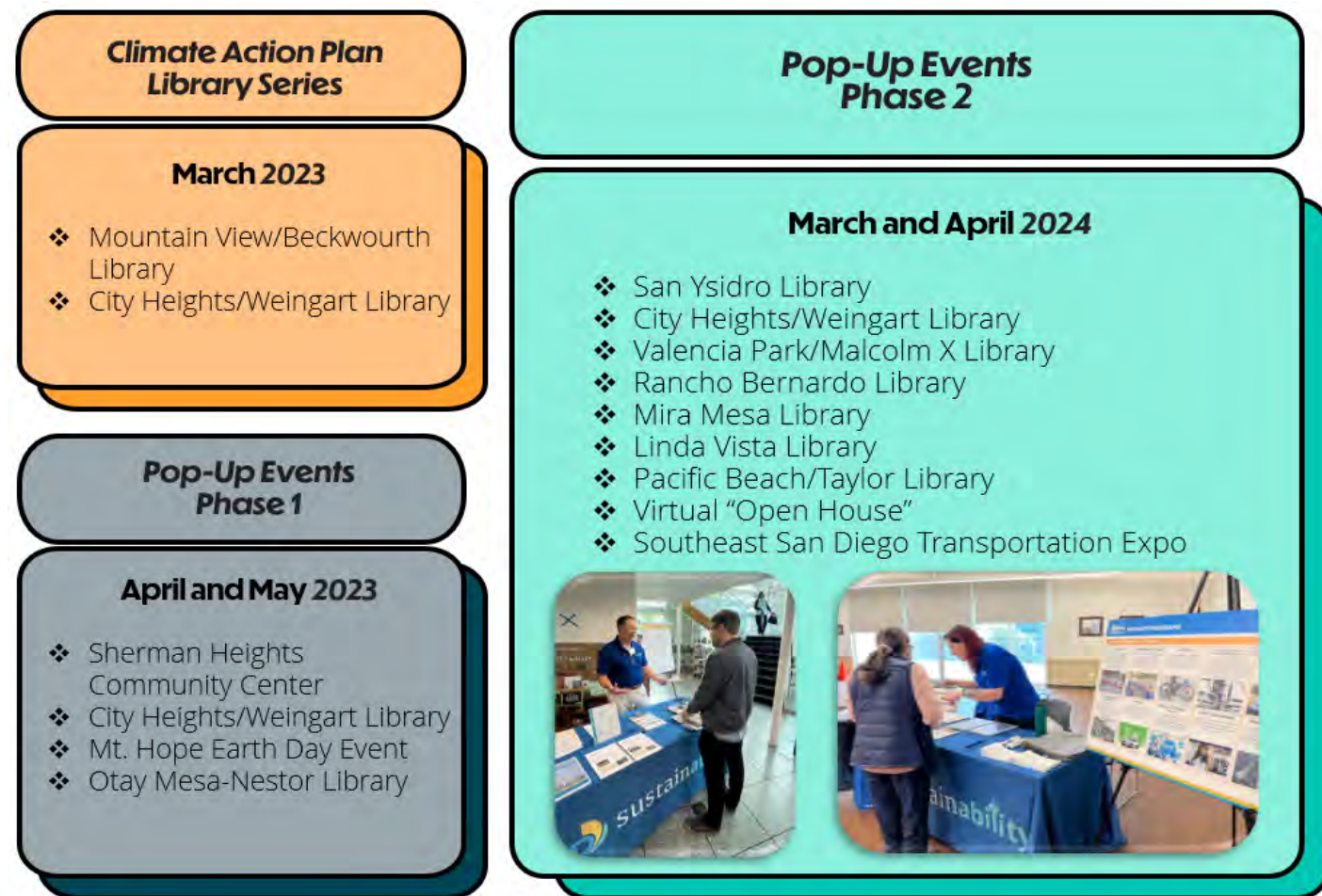
FIGURE 4-2: Summary of Mobility Master Plan Outreach Events

City staff presented information on the Mobility Master Plan as part of a series of community engagement events for the CAP hosted at local libraries and also held pop-up events to introduce the Plan and receive input in areas of the community where residents would already be present. Events were held in March, April, and May of 2023 and were critical because they allowed the project team to showcase how the Plan would further goals in the CAP and to directly connect with community members in their neighborhoods and give them an opportunity to share their everyday mobility challenges. After the draft Mobility Master Plan was released for public review, additional pop-up events were held at seven local libraries and a virtual meeting was hosted to solicit feedback on the draft plan. A summary of these outreach events is depicted in Figure 4-2 below.