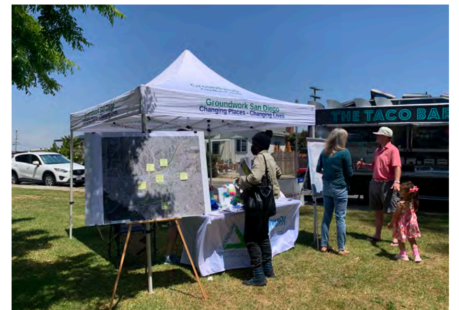
Sharing a booth with Groundwork San Diego at Mt. Hope Earth Day event