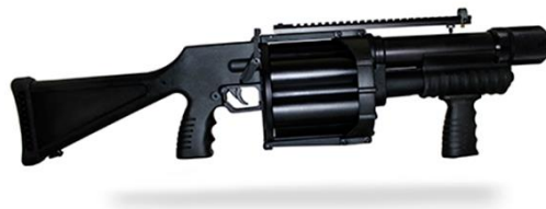
Penn Arms – Model PGL 65-40 (pictured above)

Manufacturer Description: A 40mm pump-action advance magazine drum launcher with a fixed stock and combo rail. It has a six-shot capacity and rifled barrel. Features include: Double-action trigger, trigger lock push button and hammer lock safeties.