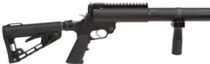
LMT – Model 1425 (Pictured Above)

Manufacturer Description: Manufactured exclusively for Defense Technology, the 1425 40LMTS is a tactical single shot launcher that features the Rogers Super Stoc expandable gun stock and an adjustable Integrated Front Grip (IFG) with light rail. The ambidextrous Lateral Sling Mount (LSM) and QD Mounting systems allow both a single- and two-point sling attachment. Users have the option of customizing the 40LMTS with an array of enhanced optics and sighting systems through the launchers picatinny rail mounting system. The 40LMTS will fire standard 40mm less lethal ammunition, up to 4.8" in cartridge length, but it is NOT designed to fire 40mm high velocity HE ammunition.