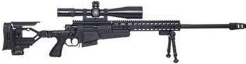
Accuracy International AX .308 Bolt Action Rifle (pictured above)

Manufacturer Description: The short action AX308 (.308 Winchester) is a worthy successor to the battle hardened AW308, boasting a raft of new features including the patented Quickloc system which allows the barrel to be changed or removed for transit in minutes using the hex key stored in the cheek piece.