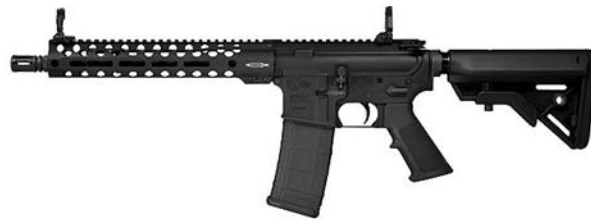
Colt Carbine LE 6933 Series (pictured above)

Manufacturer Description: Built for the demanding use of those who protect our communities every day, the Colt Enhanced Patrol Rifle (EPR) is the next evolution in the world's most dependable, thoroughly field-tested patrol rifle. Featuring an extended handguard that accepts modular rail segments for mounting a wide variety of pro-grade optics, lighting, and ergonomics-enhancing accessories, as well as the highly durable Magpul MBUS Pro Series front and rear back up sights and B5 Bravo buttstock. The Colt EPR reestablishes the Colt AR-15 as the finest tool for local, regional, and national law enforcement agencies.