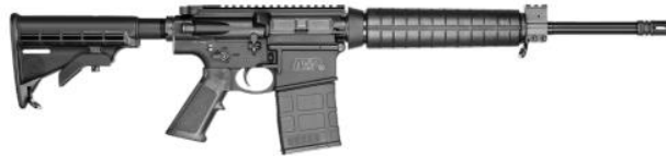
M&P 10 - .308 Semi-Automatic Rifle (pictured above)

Manufacturer Description: M&P10 Rifles are versatile, easily accessorized, and suitable for a wide variety of recreational, sport shooting and professional applications. Engineered with 5R Rifling and 1/10 Twist, the M&P10 is as accurate as it is powerful. Making short work of long range, M&P10 Rifles keep you at the ready.