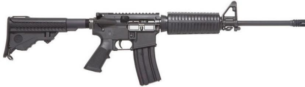
DPMS 5.56mm AR-15 (pictured above)

Manufacturer Description: No manufacturer description.