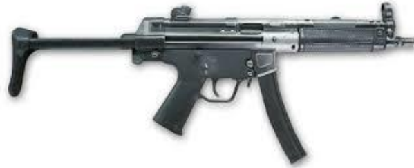
HK MP5 Submachine Gun (pictured above)

Manufacturer Description: Probably the most popular series of submachine guns in the world, it functions according to the proven roller-delayed blowback principle. Tremendously reliable, with maximum safety for the user, easy to handle, modular, extremely accurate and extraordinarily easy to control when firing – HK features that are particularly appreciated by security forces and military users worldwide.