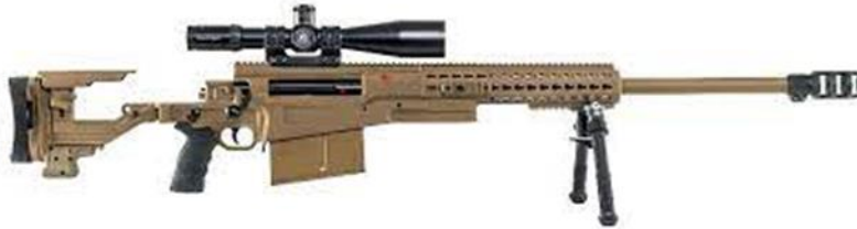
Accuracy International – AX-ELR 50 (pictured above)

Manufacturer Description: Designed to withstand constant deployment, the AX50 long range anti material rifle from Accuracy International is based on the DNA of the proven AW50. Inheriting the toughness, reliability, and ease of maintenance of its powerful predecessor, the AX50 exhibits all the features necessary to ensure superb accuracy and consistent cold shot performance in the harshest conditions.