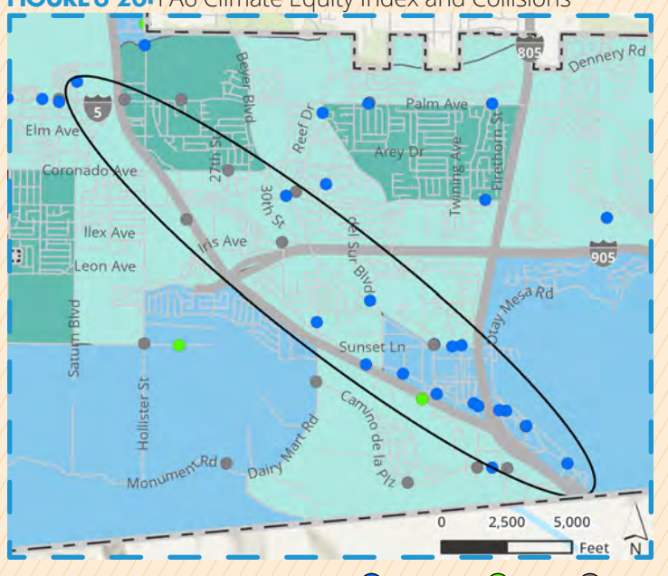
FIGURE 6-20: FA6 Climate Equity Index and Collisions

*Severe or Fatal Collision by Mode Type: Pedestrian Bicycle Vehicle