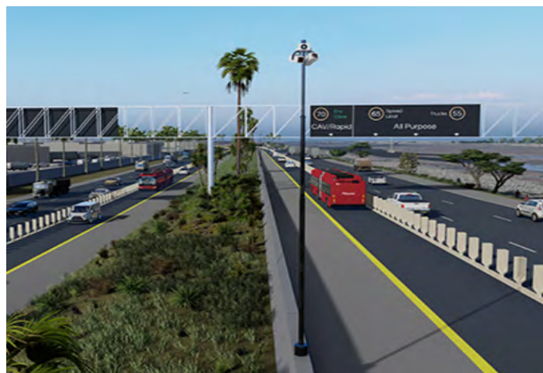
Explore private sector partnerships to implement technology-enabled infrastructure that enhances safety and optimizes the performance of roadways.