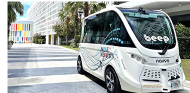
Autonomous shuttles could be designed as circulators