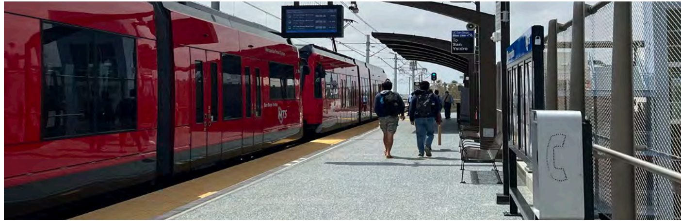
UC San Diego Blue Line Trolley station.