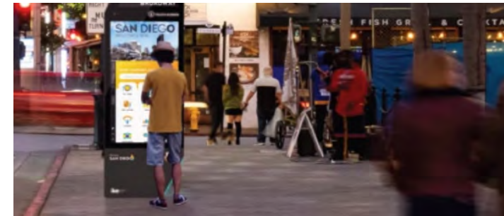
Concept of a visitor in Downtown San Diego interacting with a digital kiosk that provides an interactive source of information