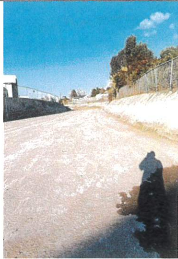
Location: Photo #1