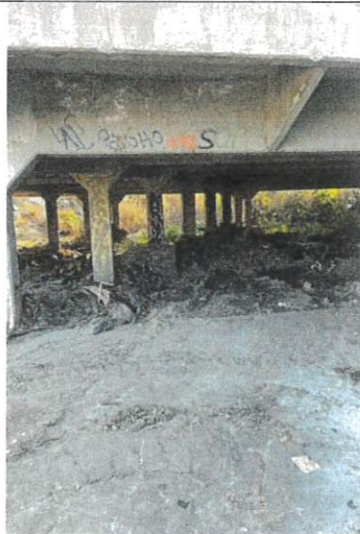
Location Photo #2