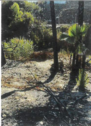
Location # Photo 2