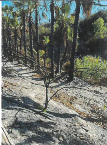
Location # Photo 1

Location Photo #3: Underneath National Street Bridge