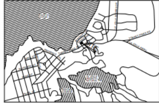
VICINITY MAP SCALE: N.T.S.