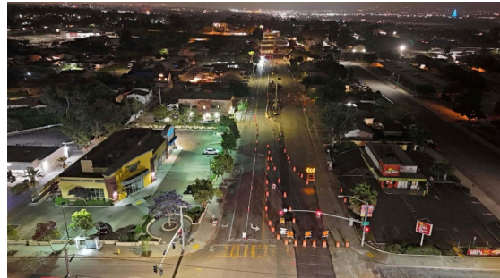
Crews continue nighttime welding activities to complete pipeline installation on Clairemont Drive.

For the Morena Conveyance South and Middle and Bike Lanes project , over 30,000 linear feet of pipeline have been installed across the alignment. Work is continuing to progress along Clairemont Drive, between Fox Avenue and Feather Avenue. Pipeline installation is occurring during daytime hours, and welding activity to complete the pipeline installation is happening during nighttime hours. Crews are also continuing pipeline installation on West Morena Boulevard, moving northwest. A new phase of traffic control was recently installed between Buenos Avenue and Morena Boulevard, where night work will take place in the Vega Street intersection, and work will occur 24 hours per day throughout the rest of the work zone.