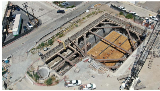
Soil freezing continues for the Morena Pump Station project.

In Clairemont, Bay Ho, Bay Park and Morena for the Morena Pump Station project , the contractor is continuing soil freezing activities. Westbound Friars Road between Napa Street and Sea World Drive will continue to be closed to vehicle traffic through the end of 2024 as crews perform ongoing work that requires the current traffic control configuration. The project team is currently evaluating the traffic control plan and is looking for alternatives to implement in early 2025 to better serve community members and commuters.