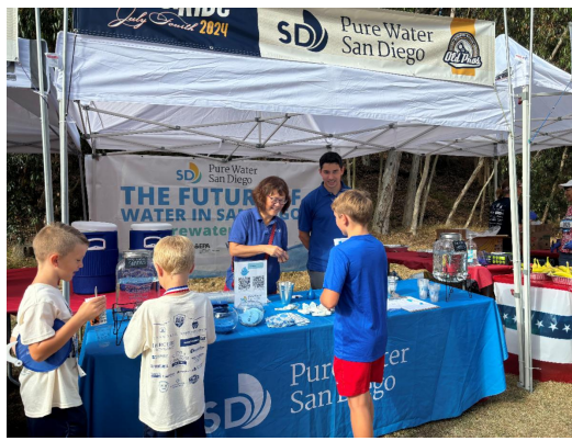
Pure Water Outreach Team at the Scripps Ranch 4th of July Run and Ride.

progress and connecting with community members about our City's water future.