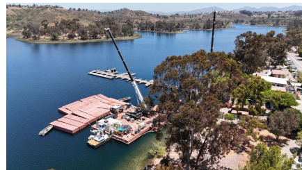
As of July 2024, Miramar Reservoir is open to on-water activities.

In the Scripps Ranch & Miramar area for the North City Pure Water Pipeline (NCPWP), Dechlorination Facility and Subaqueous Pipeline project, the Subaqueous pipeline project wrapped up major construction in July, and Miramar Reservoir was reopened to on-water recreation! We're proud that the reservoir was able to reopen ahead of schedule.