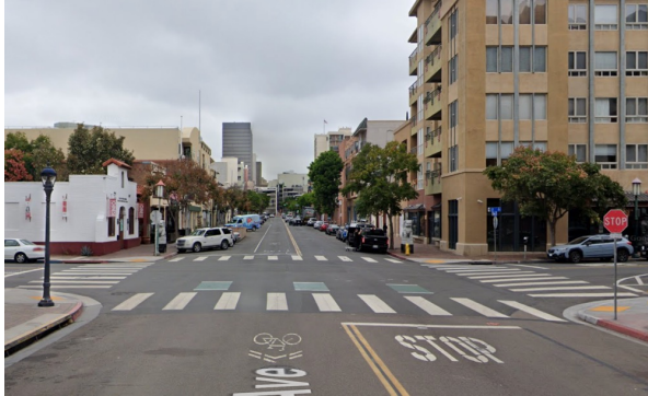
Current View – Northbound on 3rd