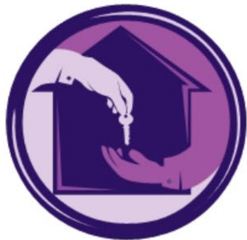
Southern California Housing Collaborative