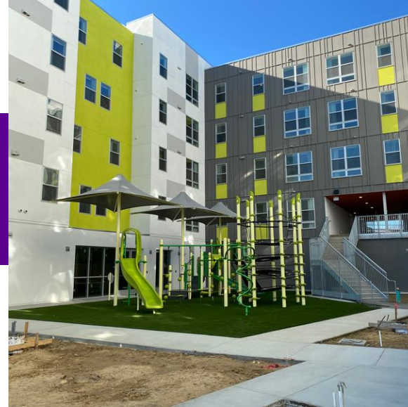
Building more homes