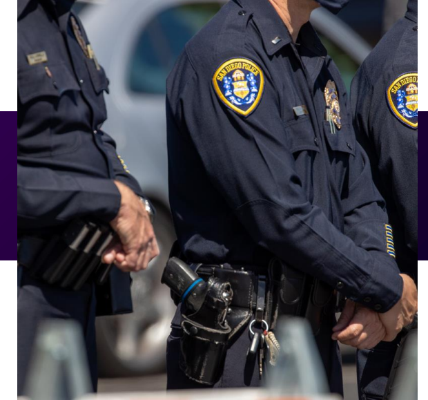
Ensuring San Diego stays one of the safest big cities in America