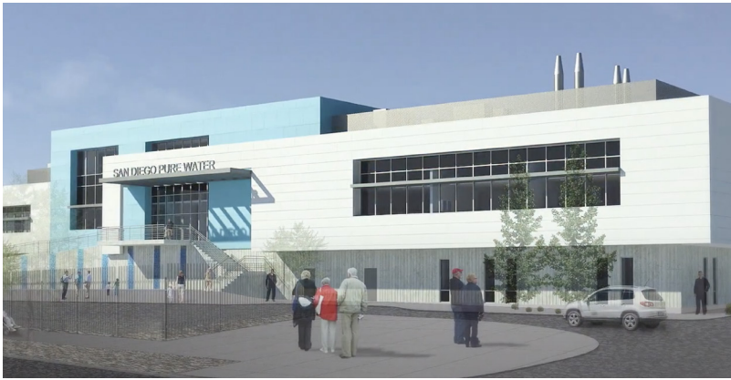
Rendering of the North City Pure Water Facility

Ultraviolet Disinfection/ Advanced Oxidation