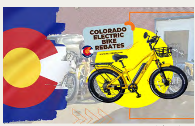
Denver's e-bike rebate