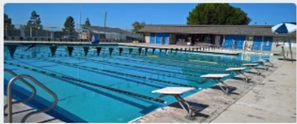
Allied Gardens Pool