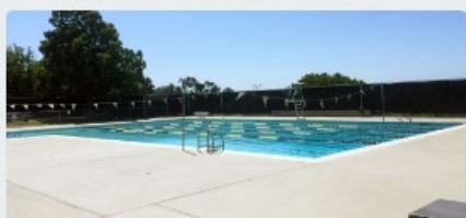
Colina del Sol Pool