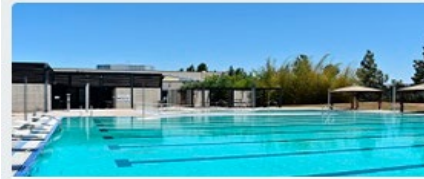
Carmel Mountain Community Pool