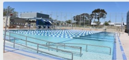
Standley Aquatic Center