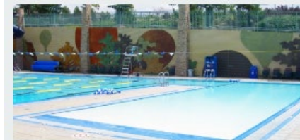
Carmel Valley Pool