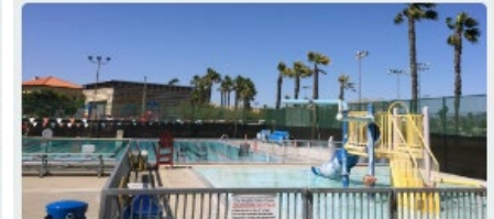
City Heights Swim Center