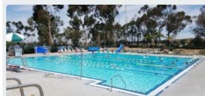
Tierrasanta Community Pool