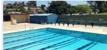
Martin Luther King, Jr. Pool