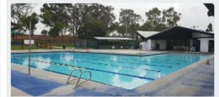
Vista Terrace Pool