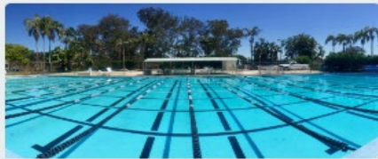
Bud Kearns Memorial Pool