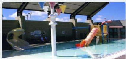
Ned Baumer Aquatic Center