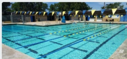
Swanson Memorial Pool