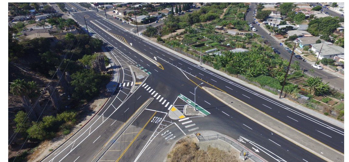
54th Street and Chollas Parkway mobility improvements

Meaningful mobility improvements focus not just on one mode, but multiple modes. One of San Diego's greatest assets for mobility is its year-round temperate climate. The City has ideal weather for multimodal transportation and a culture that is receptive