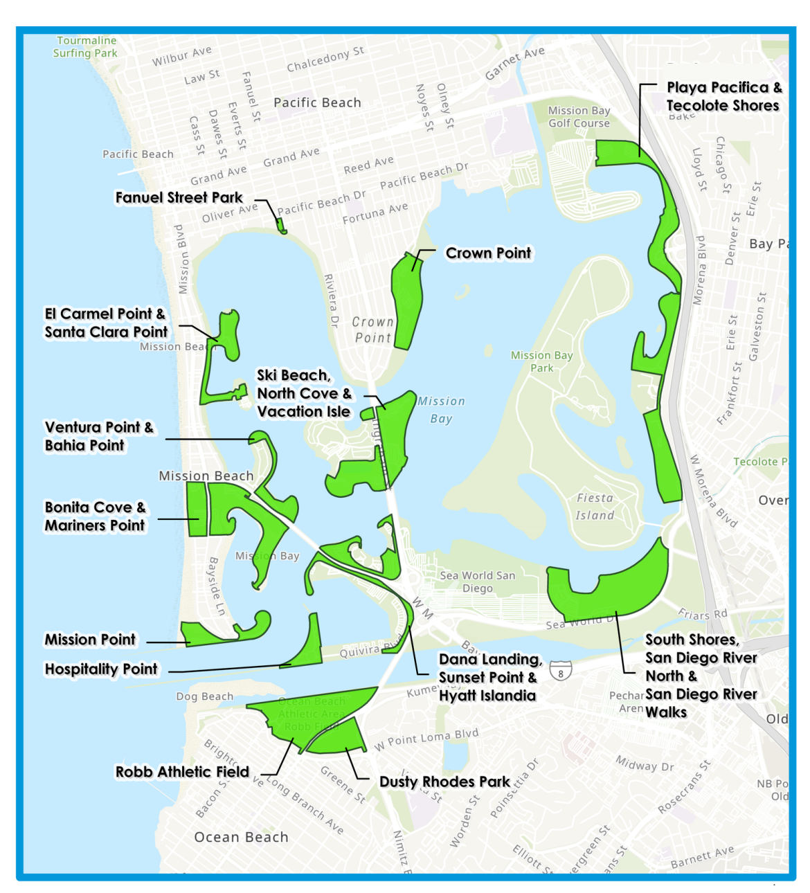
The Mission Bay Park Improvements PEIR and PER documents exclude DeAnza Cove and Fiesta Island, due to other studies and plans specific to those areas.