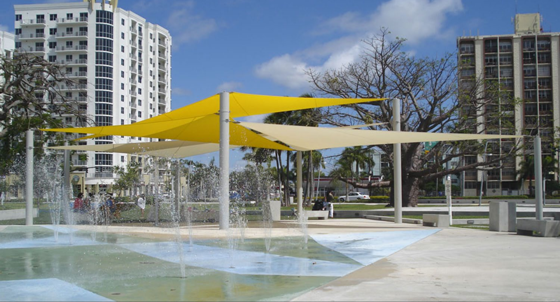
WATER PLAY WITH SHADE SALES