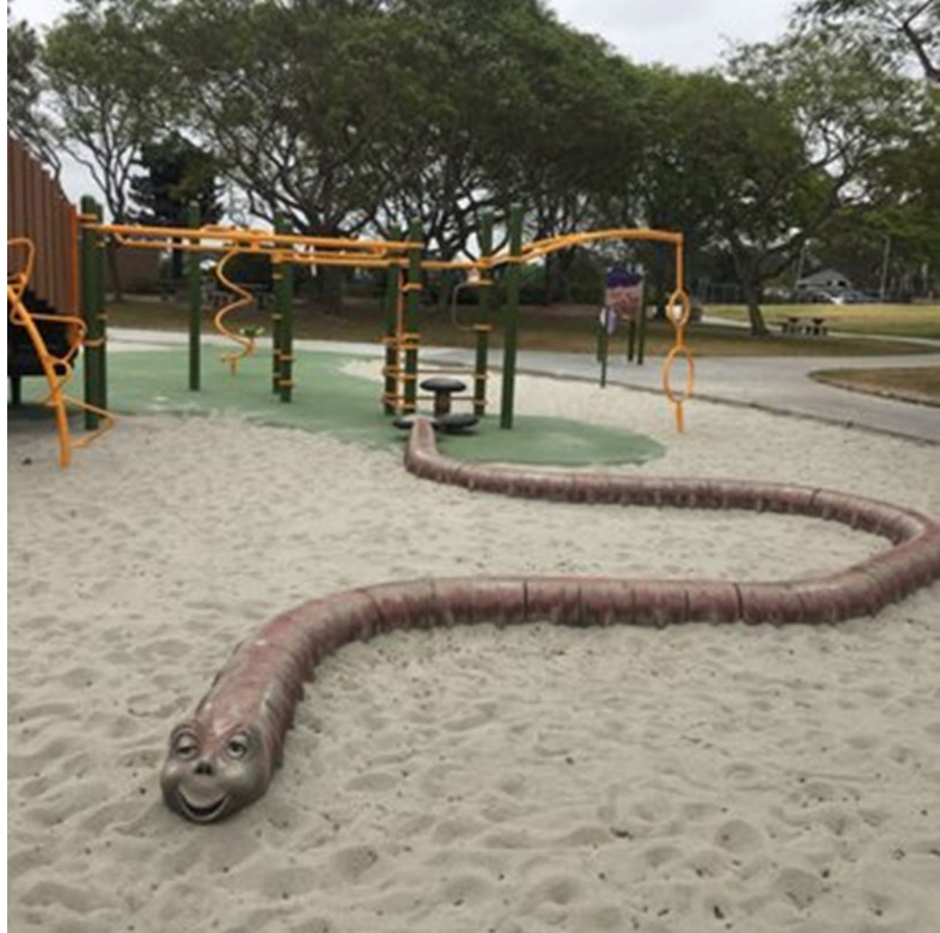
WHIMSICAL & NATURE PLAY