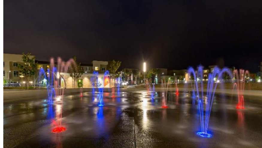
INTERACTIVE WATER PLAY