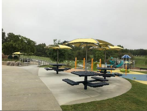
TABLES WITH UMBRELLAS