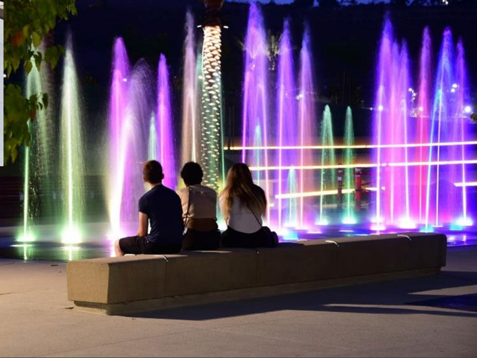
INTERACTIVE WATER PLAY