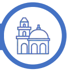
Table HP-1 Regional History (cont.)