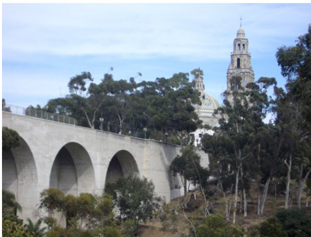
Cabrillo Bridge and Balboa Park