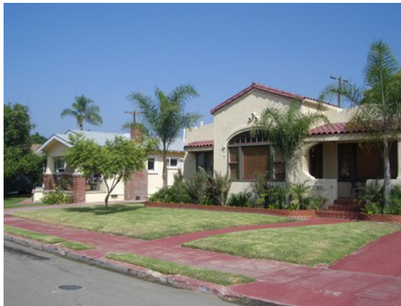
Burlingame Historic District.

The City's commitment to historic preservation through maintaining Certified Local Government (CLG) status results in multiple economic benefits beyond the opportunity