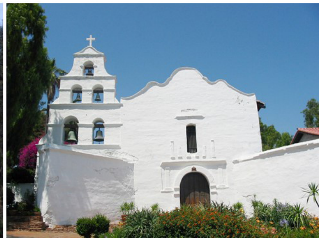
Mission San Diego de Alcalá