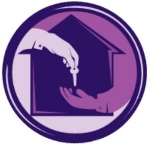
Southern California Housing Collaborative