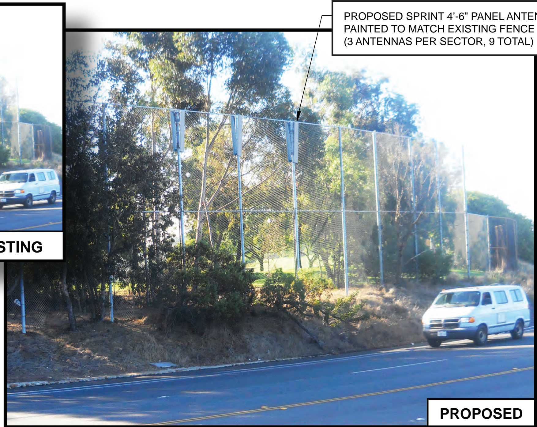
PROPOSED SPRINT 4'-6" PANEL ANTENNAS PAINTED TO MATCH EXISTING FENCE (3 ANTENNAS PER SECTOR, 9 TOTAL)