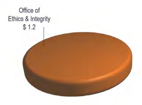
Office of Ethics and Integrity Business Center FY 2007 Annual Budget – $1.2 million (In Millions)

The Office of Ethics and Integrity business center consists of the Office of Ethics and Integrity department.