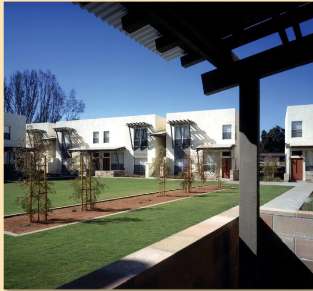
Orient to and Define Open Space