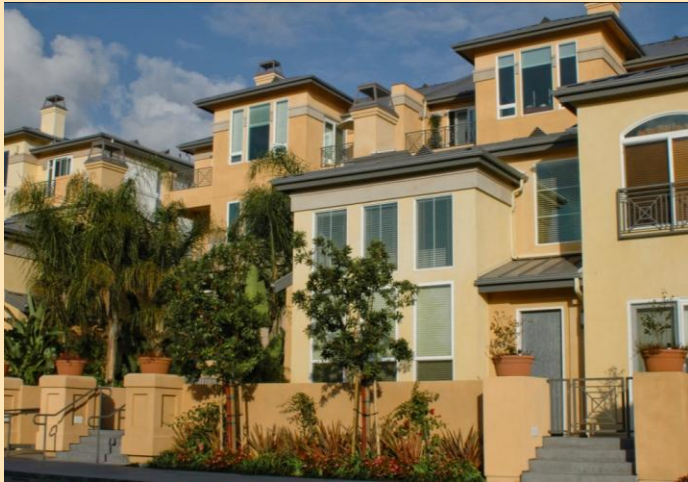
Step Back Upper Stories