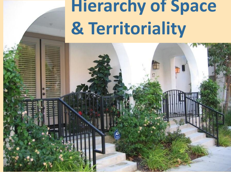
Hierarchy of Space & Territoriality