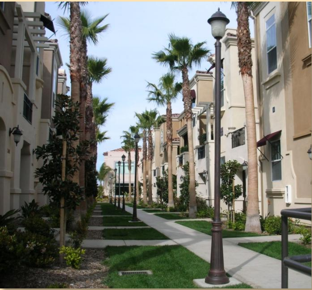
Face Pedestrian Paths