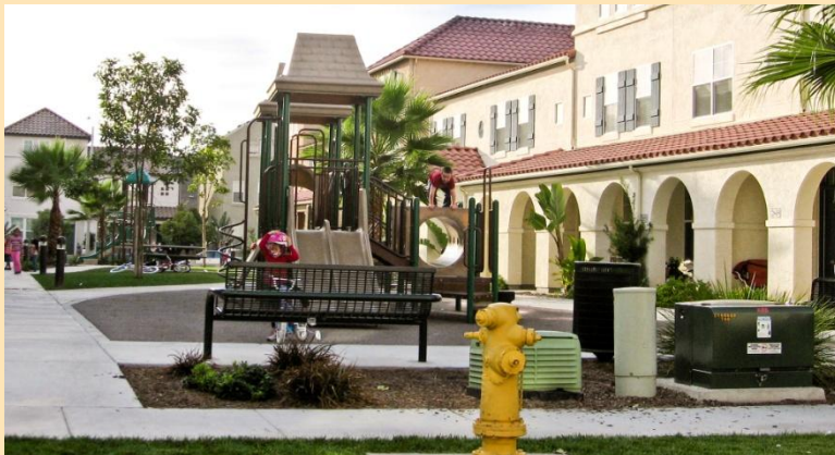
Natural Surveillance: Eyes on the Street & Open Space