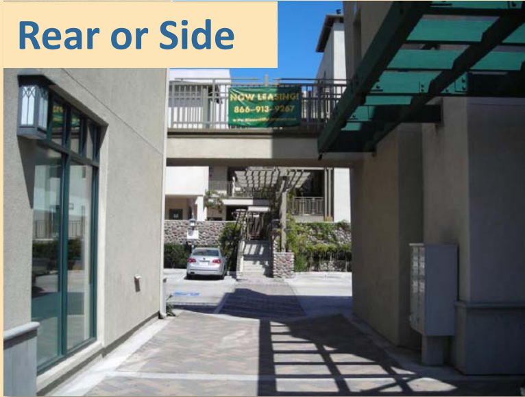
Rear or Side