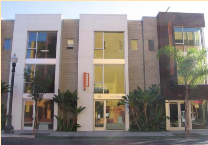
Break Down the Massing