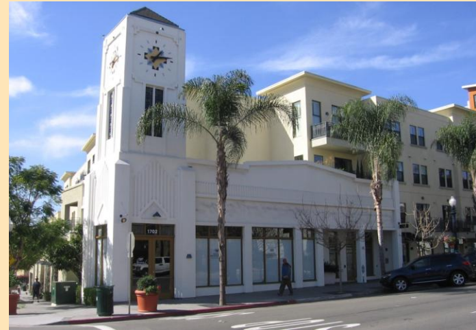
Provide Variable Heights