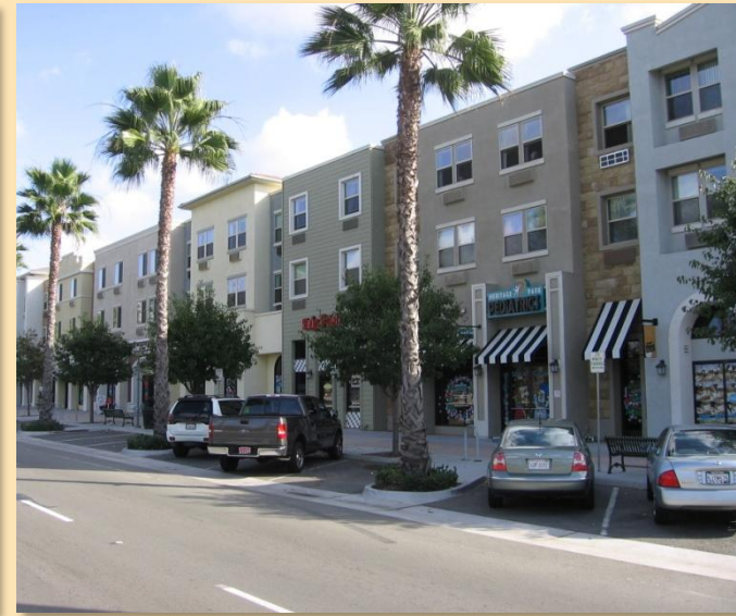
Face the Street