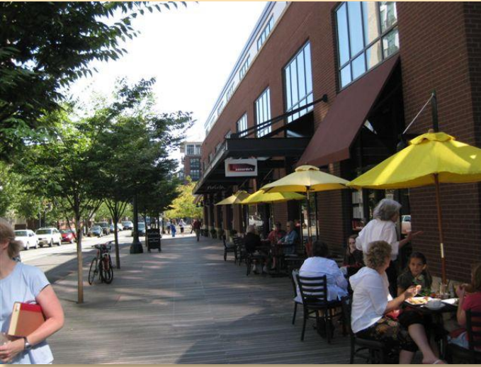
Street Wall – Build-To