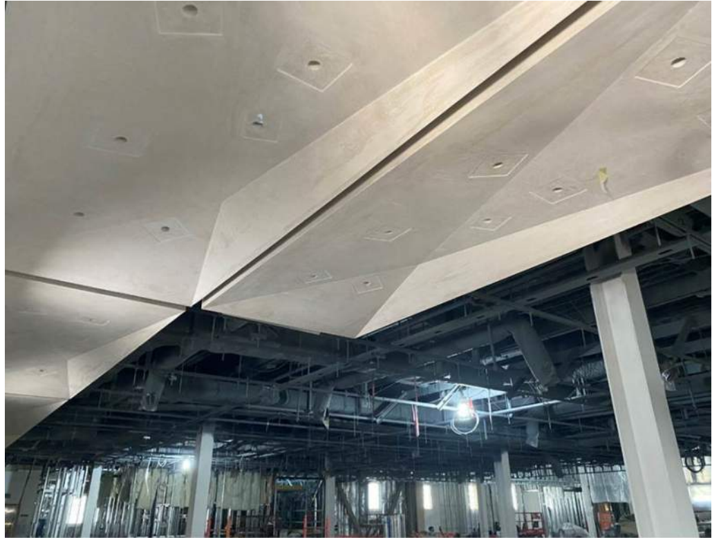
Gallery level custom GFRG ceiling panel progress on the Gallery level along with ongoing framing and MEP rough-in the back ground.