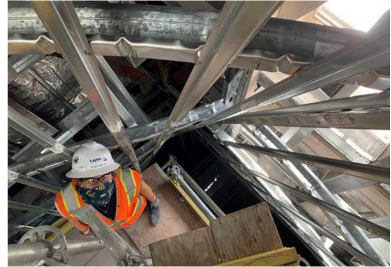
Layton team engaging with the Luce et Studio design team in the Collaborative level, in the Arcade, and atop the Chihuly Stair Tower.