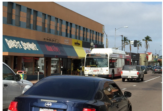
Vehicle traffic along major roadways is the primary source of noise within the community.