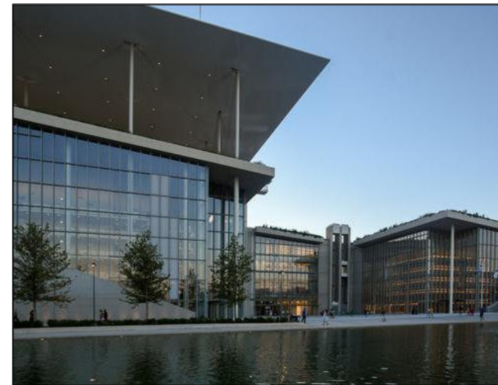
Stavros Niarchos Foundation Cultural Center Business Planning and Programming Strategy