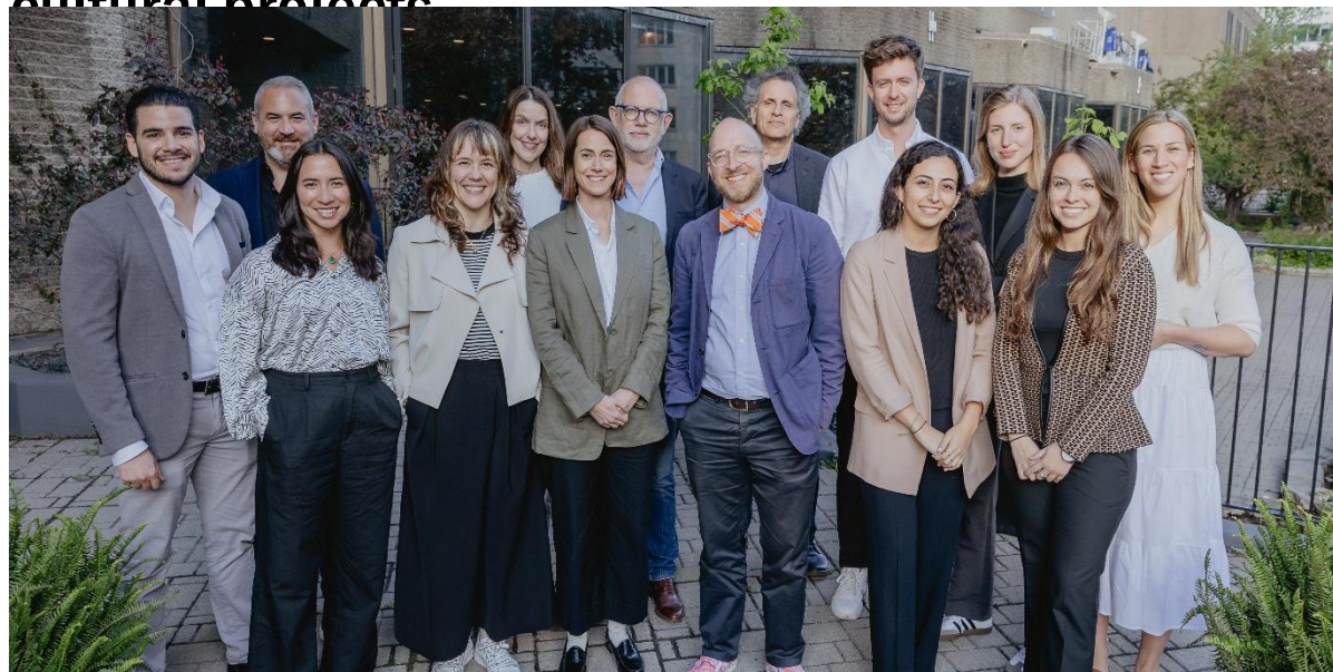
Members of the AEA team at the Global Cultural Districts Network 2023 Convening

Since 1990, we have successfully delivered more than 1,200 assignments in 42 countries, helping clients around the world plan and realize vital and sustainable cultural projects