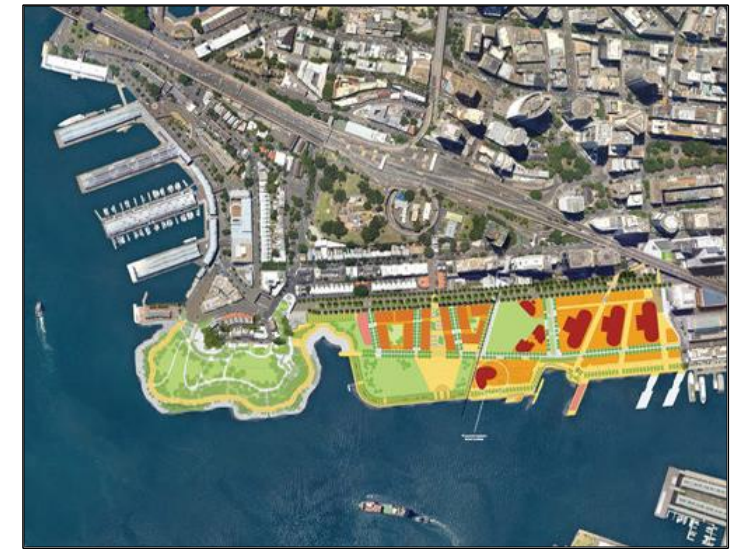
Barangaroo Development Authority Concept Development and Feasibility Study