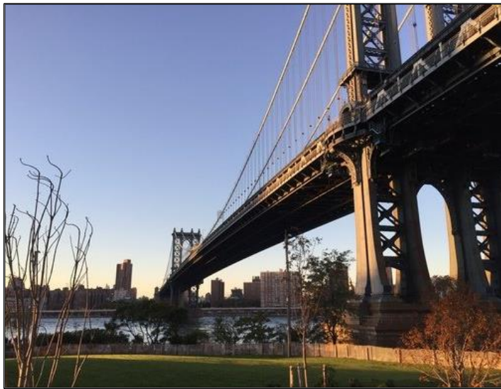
Brooklyn Bridge Park Strategic Programming Plan

Our candid and impartial advice draws on our team's deep knowledge of the cultural sector, as well as robust research and analytical insight