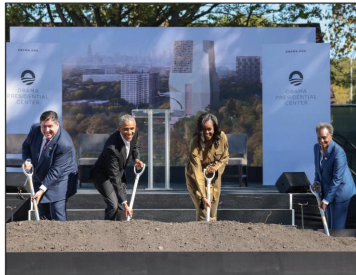
Obama Presidential Center Operational Planning