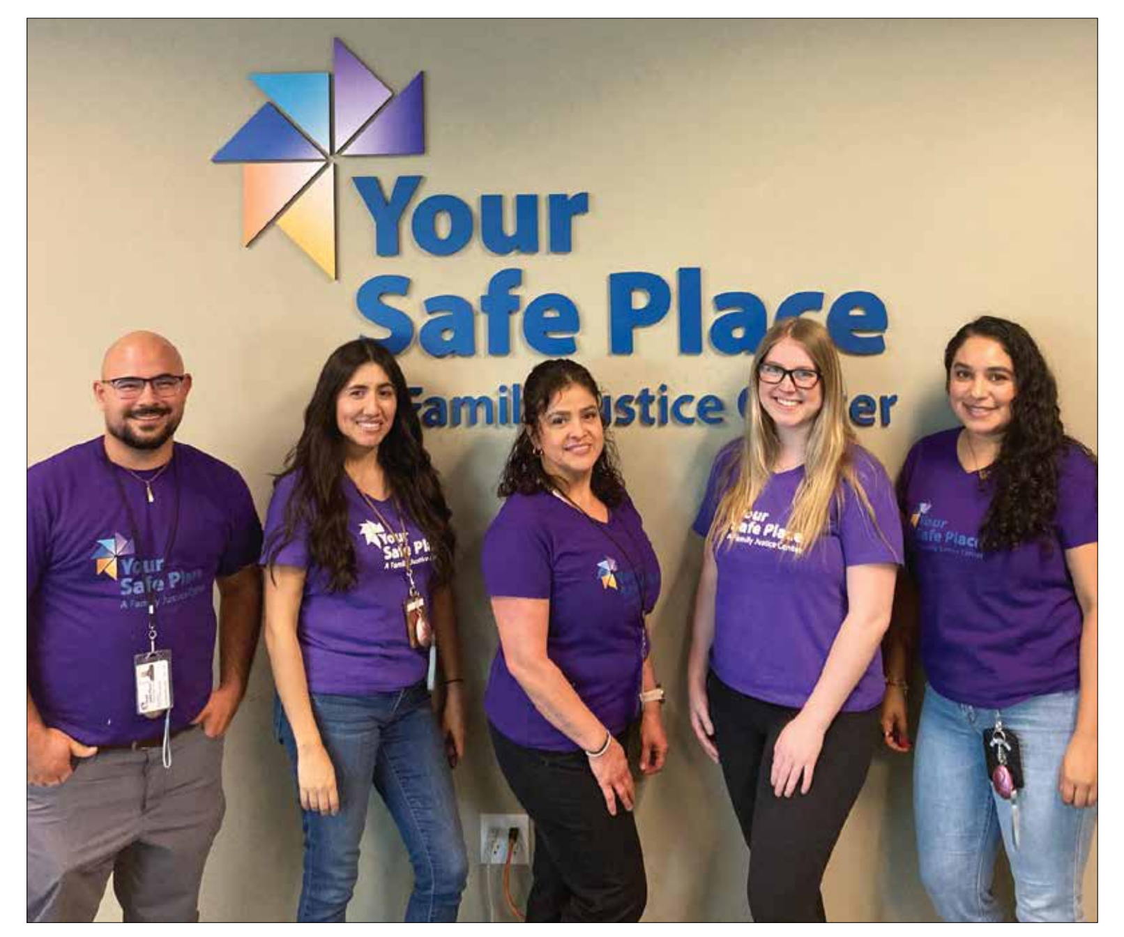
Client Care Coordinators

We express our deepest appreciation to each of YSP 's Client Care Coordinators . Your dedication and empathy have been a guiding light for survivors seeking help at YSP . Your tireless efforts and support have not only provided immediate comfort but also a pathway to healing and empowerment. Thank you for all that you do!