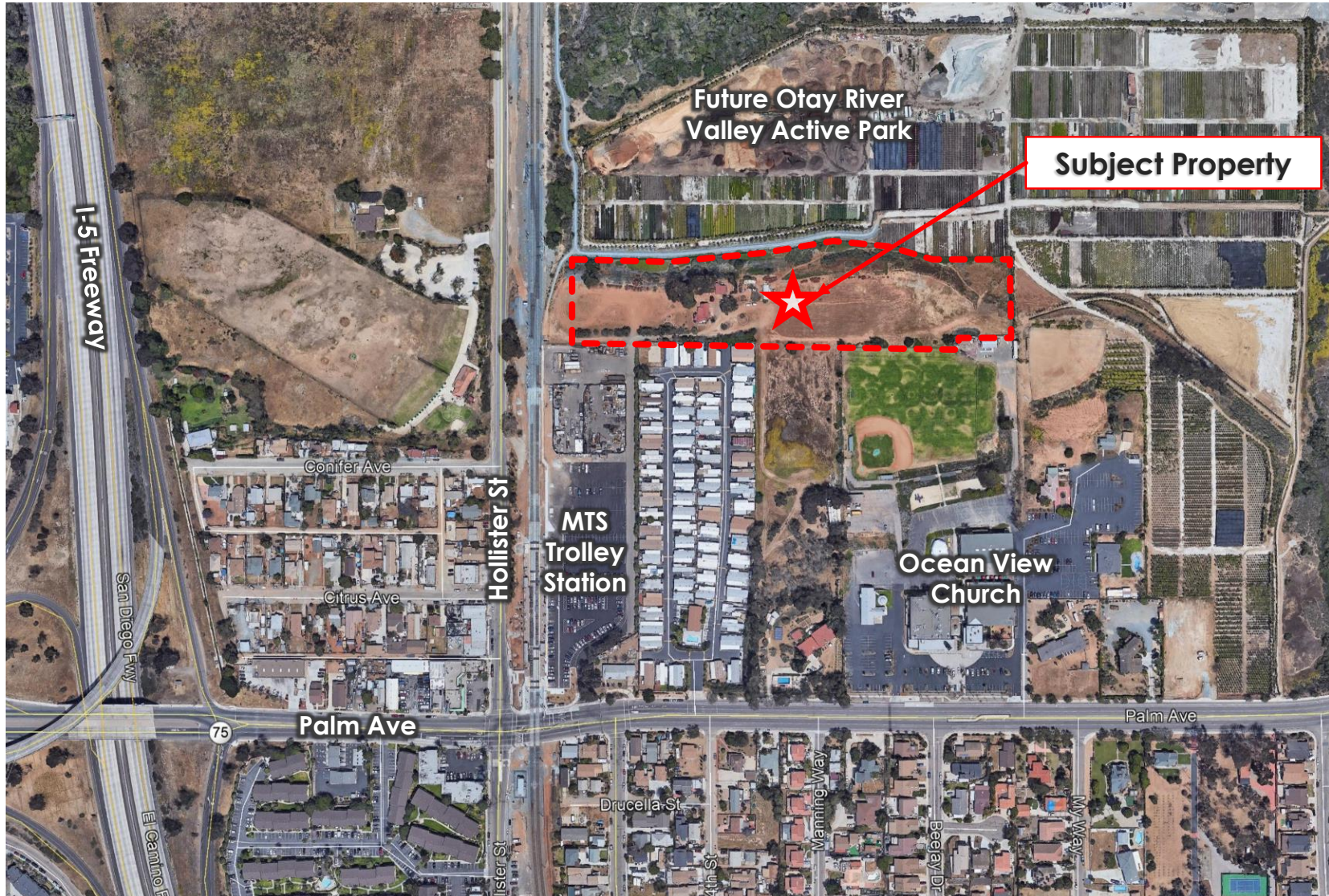
Figure 1 Palm & Hollister - Project Location Map and Aerial