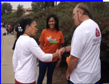
Supporting the Rock Church Litter Ministry at their community clean-up in Paradise Hills.