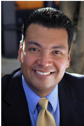
Honorable Alex Padilla California Secretary of State