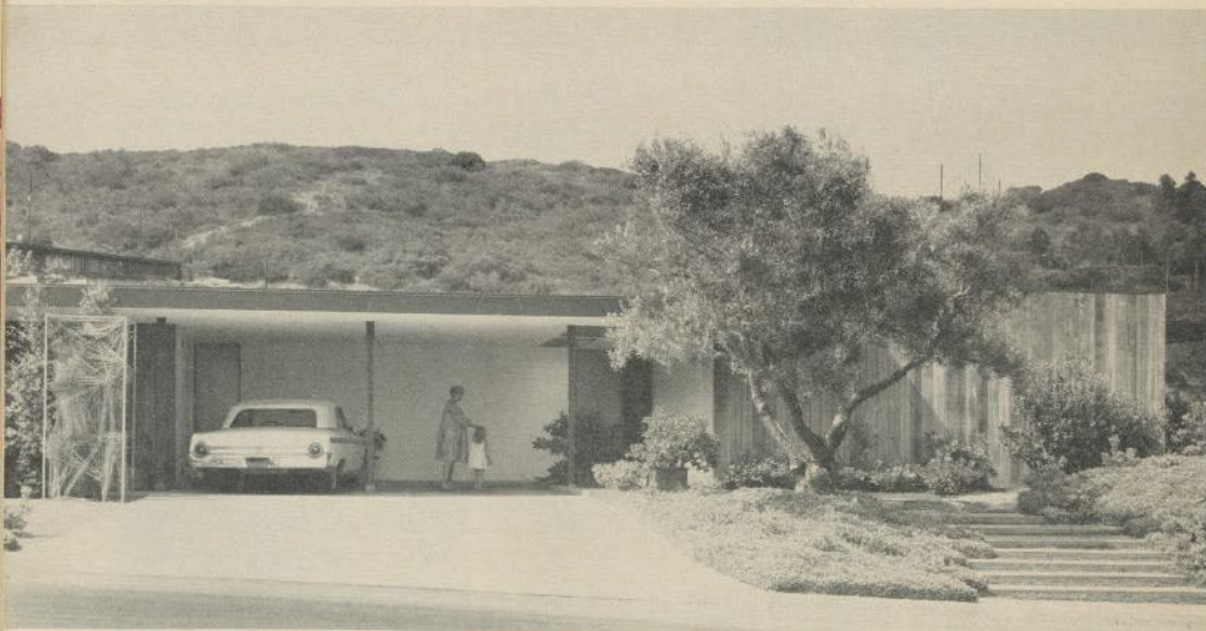
Behind the wood wall at right are secluded gardens off the master bedroom and bath. The entry shares its opening with the carport and has a sky-lit walk. The metal garden sculpture at left is by Russell Forester. Broad entry steps to right of olive