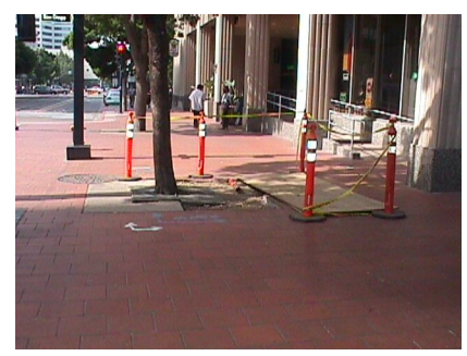
(No longer use these types of protective barricades)