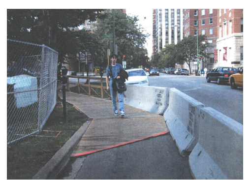
(Acceptable Temporary Barrier – "Concrete Barrier")