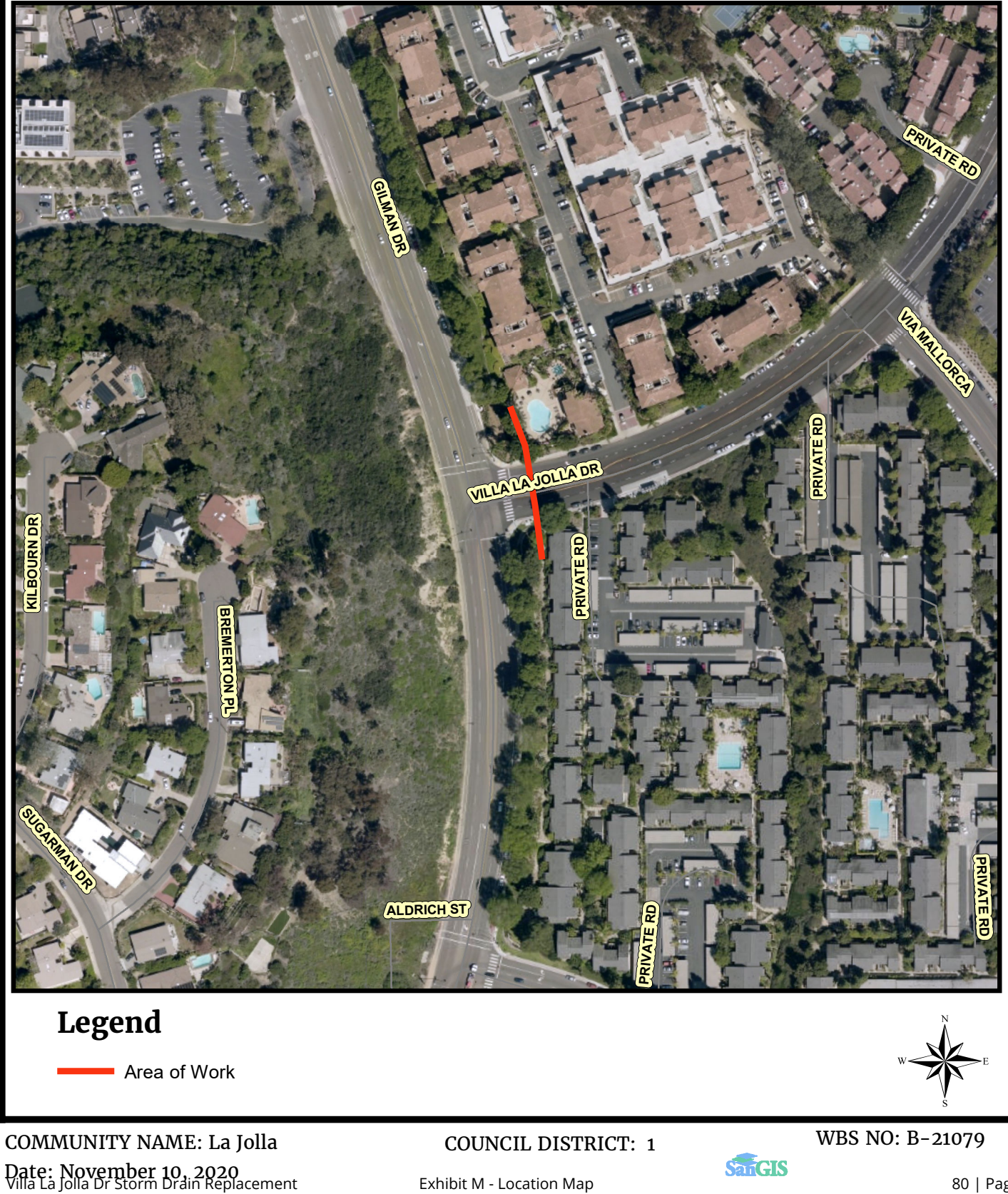
Exhibit M - Location Map

FOR QUESTIONS ABOUT THIS PROJECT Call: 619-533-4207 Email: engineering@sandiego.gov