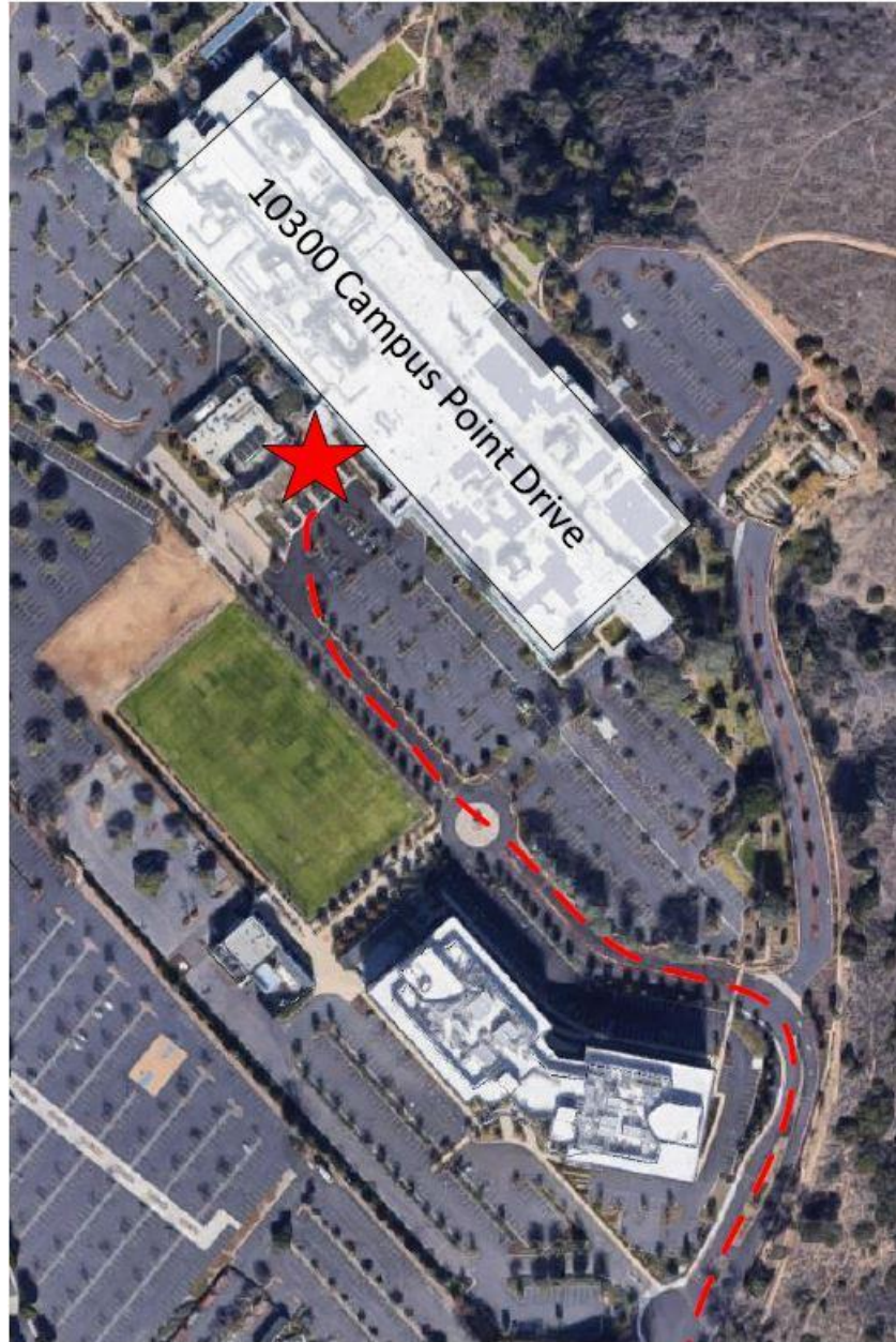
Voting Location is marked by the RED STAR