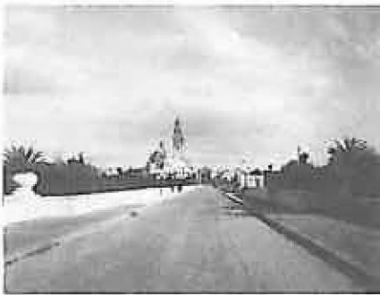
The grand entrance to the Central Mesa-1915.

On July 25, 1989, the Balboa Park Master Plan was approved by the San Diego City Council. In October of the same year the City of San Diego engaged to prepare a Precise Plan for the Central Mesa of Balboa Park. The purpose of the Precise Plan is to further define the goals and objectives of the Master Plan and provide specific guidelines for their implementation.